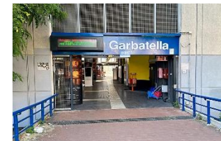
Underground Line B Garbatella stop (5 stops from Termini Station) which is about 13 minutes walking distance from the Venues