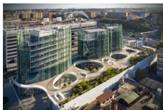
September 17 Rectorate of the University Roma Tre Tower A Via Ostiense, 133