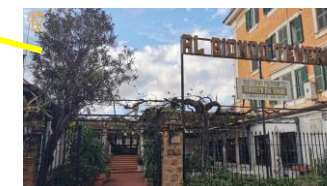
Social Dinner & After dinner Restaurant "Il Biondo Tevere" Via Ostiense, 178 Circolo degli Illuminati, Via Giuseppe Libetta, 1