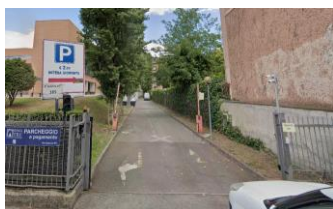
Parking Viale Ostiense, 165 Open from 8.30 to 20.00 Saturday closed The cost is 2€/day